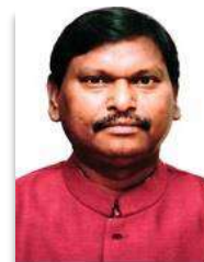
Minister of Tribal Affairs, Shri Arjun Munda

On 15th May 2020, Hon'ble Minister of Tribal Affairs, Shri Arjun Munda launched GOAL initiative, a Facebook funded program in collaboration with the Ministry of Tribal Affairs, aimed at upskilling and empowering tribal youth across India to become digital young leaders. This event was also graced by the presence of Hon'ble MoS, Smt. Renuka Singh Saruta.