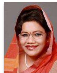
Minister of State, Smt. Renuka Singh Saruta