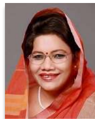
Minister of State, Smt. Renuka Singh Saruta