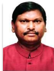
Minister of Tribal Affairs, Shri Arjun Munda

On 15th May 2020, Hon'ble Minister of Tribal Affairs, Shri Arjun Munda launched GOAL initiative, a Facebook funded program in collaboration with the Ministry of Tribal Affairs aimed at upskilling and empowering tribal youth across India to become digital young leaders. This event was also graced by the presence of Hon'ble MoS, Smt. Renuka Singh Saruta.